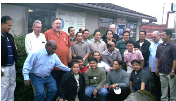
Verrazano Bridge Celebration – October 14, 2006